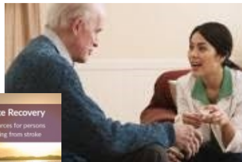
Choices and Changes: Motivating Healthy Behaviours

The Guide for Stroke Recovery , a stroke self-management resource, accompanies this training to support healthcare providers to empower persons with stroke and their families/caregivers to take an active role in their recovery.